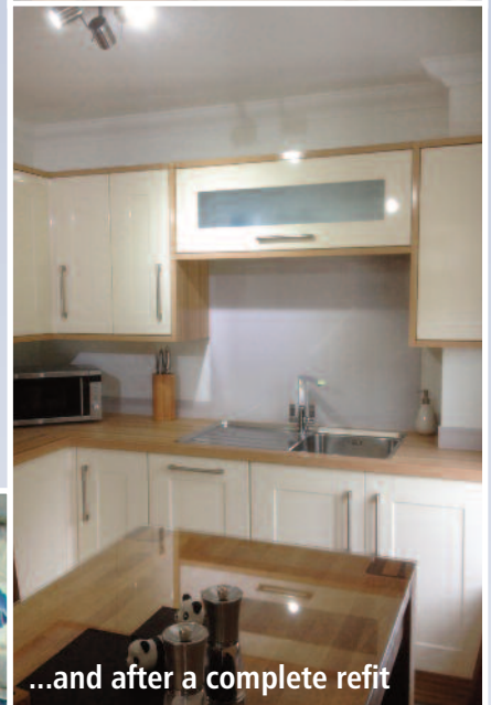
...and after a complete refit