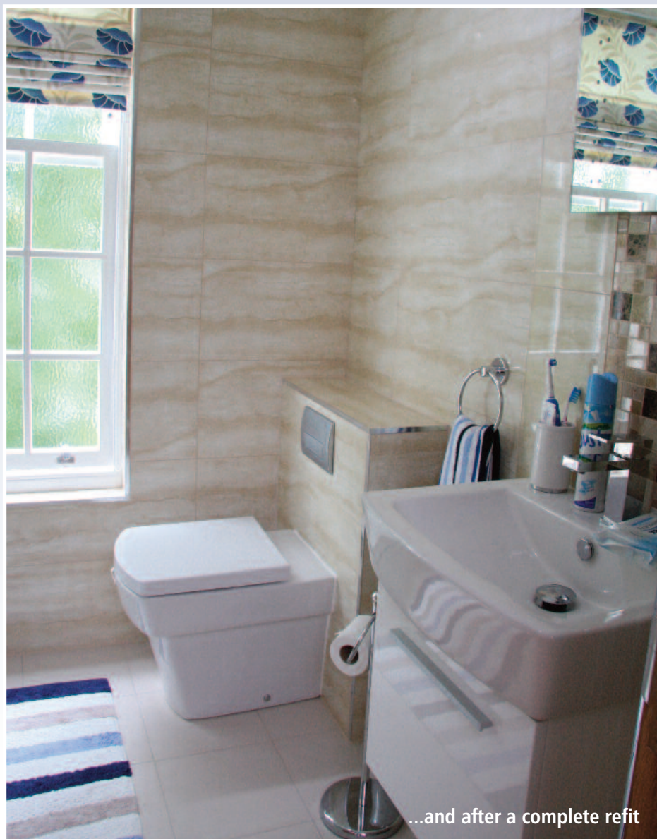
...and after a complete refit